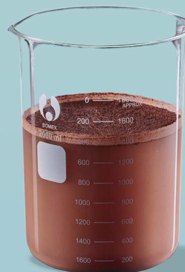
OTHER MAKEUP FORMULATIONS