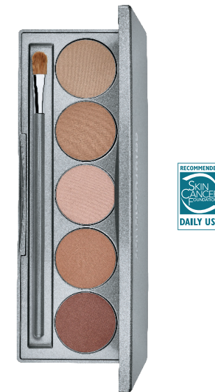
MINERAL CORRECTOR PALETTE SPF 20

Forget you're wearing foundation with Colorescience® Natural Finish Pressed Foundation. A lightweight, hydrating, and protective formula that reveals your smoother, radiant complexion. Available in a range of shades suitable for a variety of skin tones.