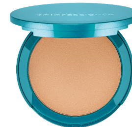
NATURAL FINISH PRESSED FOUNDATION SPF 20

Take the mess out of minerals with Colorescience® Loose Mineral Foundation Brush. Self-dispensing sheer to medium foundation coverage, and chemical-free UV and environmental protection – all in one simple, convenient application.