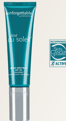
TINT DU SOLEIL™ WHIPPED FOUNDATION SPF 30

Colorescience® antioxidant- and vitamin-infused, broad spectrum SPF 20 & 30 foundations come in three finishes—liquid, loose or pressed—and a considered shade selection that provides sheer to full coverage for porcelain to deep skin tones. Conceal and finish with Mineral Corrector Palette; featuring five skin-neutralizing shades – blendable to match any skin tone.