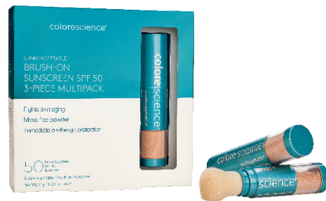
SUNFORGETTABLE® BRUSH-ON SUNSCREEN SPF 50 MULTIPACK

Colorescience® offers bundles and value sets that let you stock up on your favorites or discover customized regimens tailored to your skin concerns.