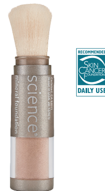
LOOSE MINERAL FOUNDATION SPF 20

Nourish and even out complexion with Colorescience® Tint du Soleil™. Multi-vitamin complex, peptides, ceramides, and milk lipids improve the appearance of skin tone while the creamy, hydrating whipped formula feels like bare skin at its best. All while zinc oxide and titanium dioxide deliver chemical-free UV and environmental protection.