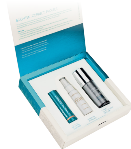
EVEN UP® CORRECTIVE KIT

This customized kit features a 3-in-1 proprietary formula that instantly neutralizes the appearance of redness, helps soothe and calm sensitive skin, and provides SPF 50 protection while its patent pending BioSolace™ complex helps provide ongoing relief from sensitivity and the appearance of redness. Kit includes: Sunforgettable® Brush-on Sunscreen SPF 50 Mini, All Calm™ Clinical Redness Corrector SPF 50, Hydrating Mist.