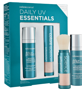
DAILY UV ESSENTIALS

Three is better than one with this special value multipack (buy two, get one free). Sunforgettable® Brush-on Sunscreen offers powerful SPF 50 UVA/UVB defense, alone or over makeup. Sheer, natural-looking finish—one simple, on-the-go application.