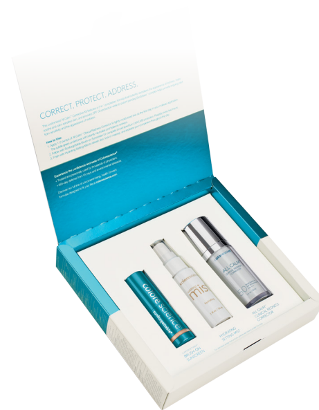
ALL CALM™ CORRECTIVE KIT

Save with our bundle of Daily UV Protector SPF 30 and Sunforgettable® Brush-on Sunscreen SPF 50 for a multi-level first layer of UVA/UVB protection and our award-winning mineral sunscreen brush for easy reapplication throughout the day.